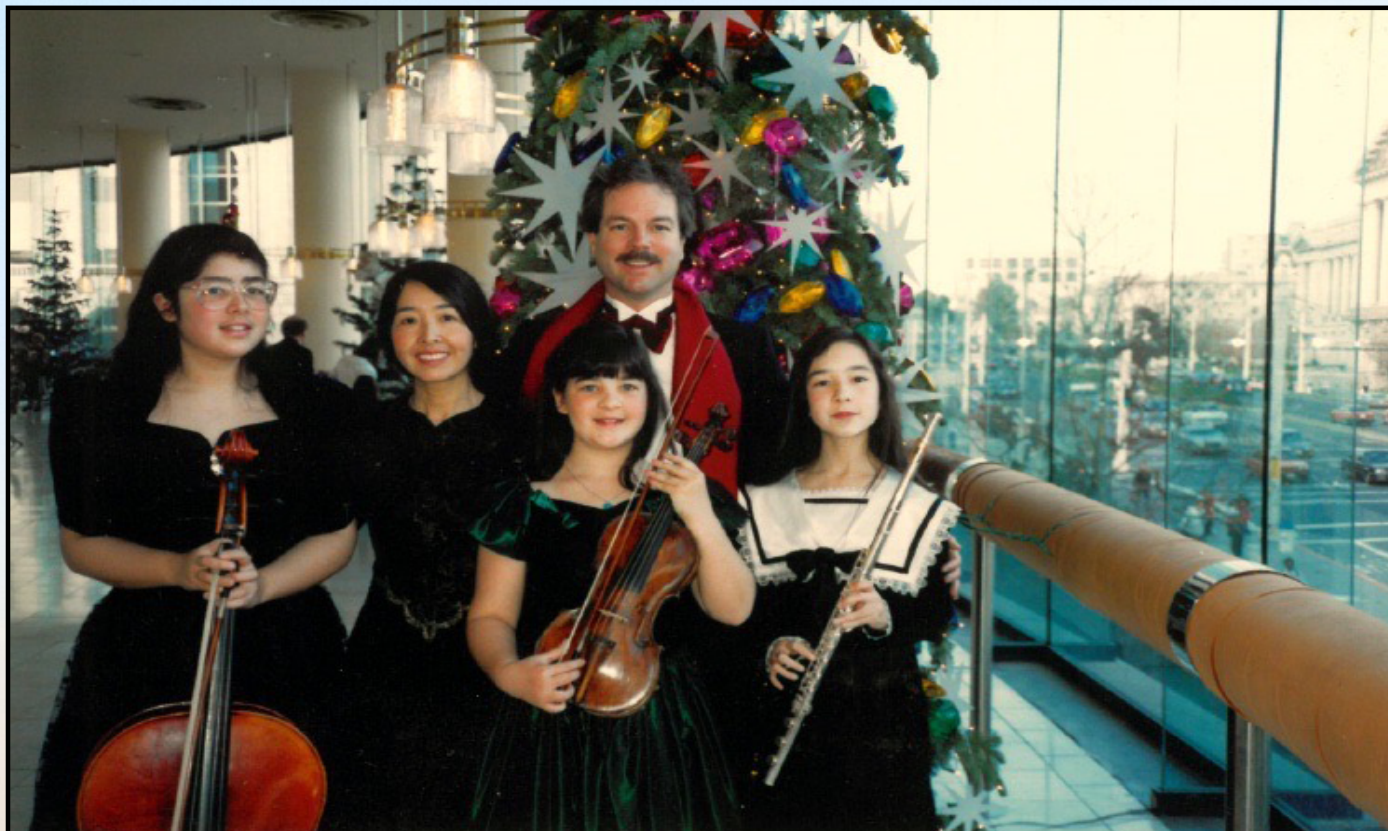
Lane Family Ensemble