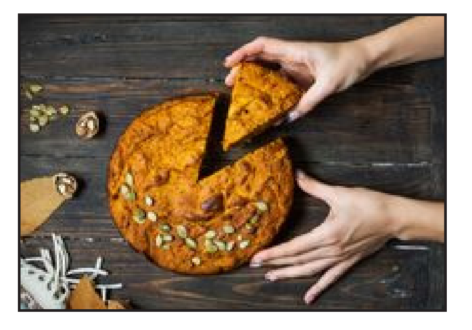
"Gifts that we cannot or do not hand on to one another die. Hand on the gift. Don't let your love die."