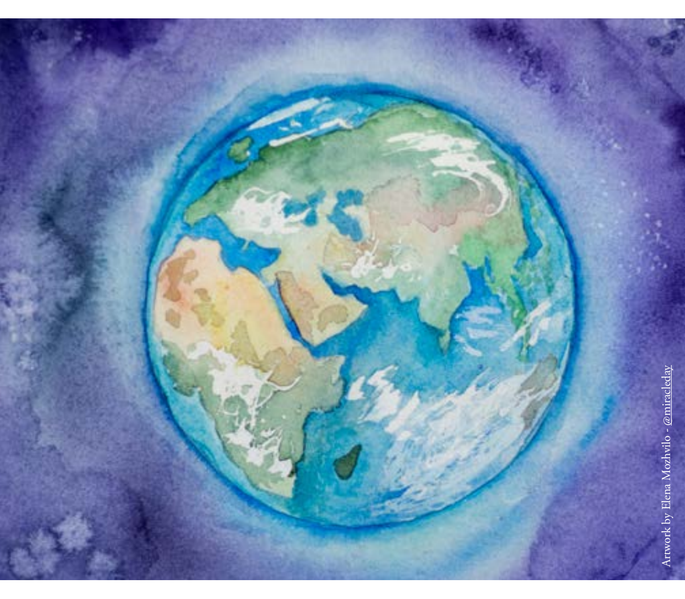
First Unitarian Universalist Society of San Francisco Sunday, April 19, 2020, 10:50 AM