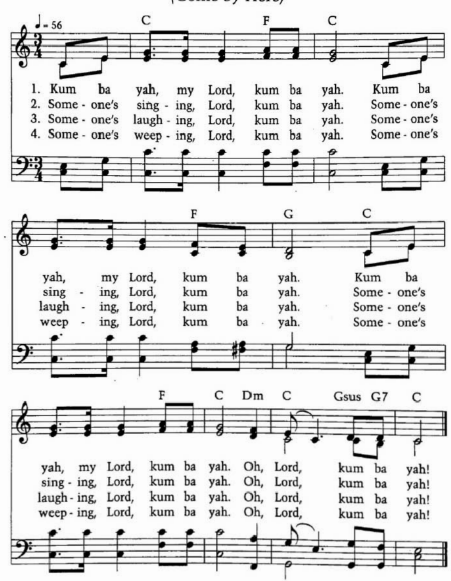
5. Someone's praying, Lord . . .