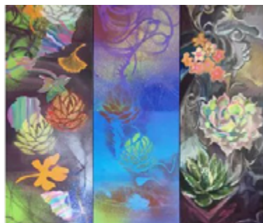
Columns Triptych (Phenomenal Growth)