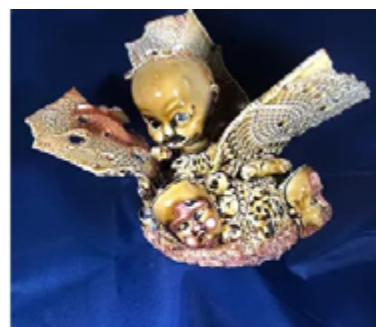
My Beautiful Magical and Strange