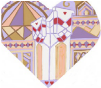
Out of the Swamp JF Ellman...