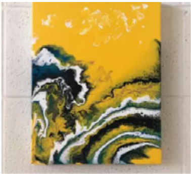
Valley Alife Jang...