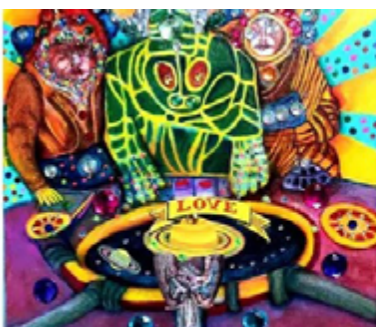
Love will cure the Virus and the World