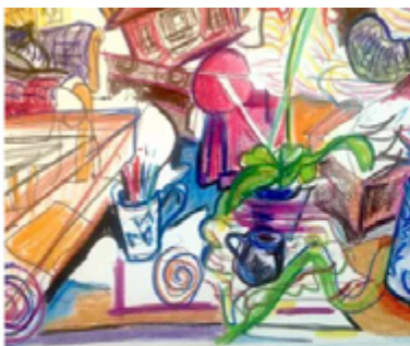
Stir Crazy Shelter in Place