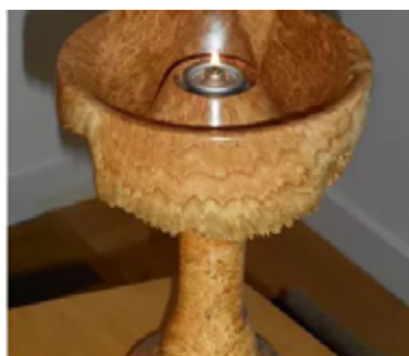
Red Malee Burl Chalice