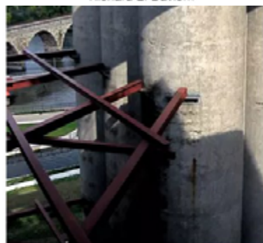
Lines & Arcs