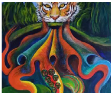
Bring It On