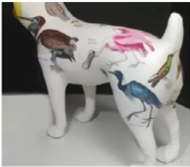
Bird Dog Jane Way...