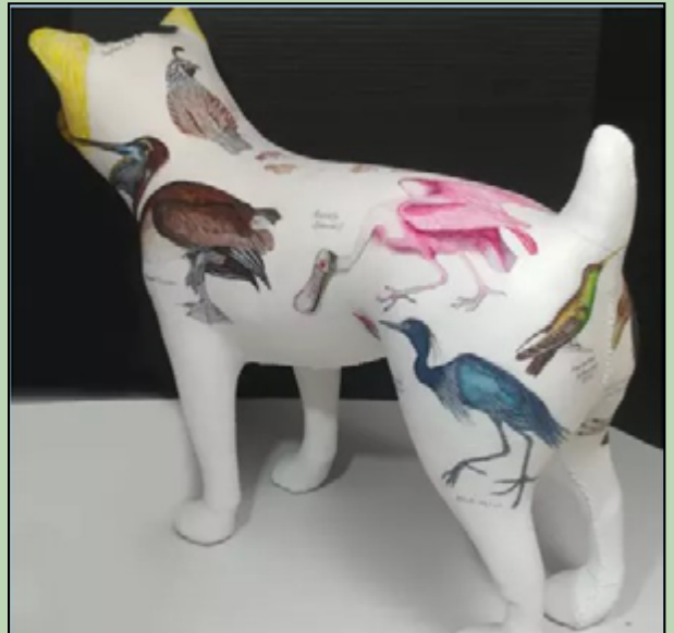
Bird Dog by Jane Way ( view here )

Check out the gallery on the UUSF website here .