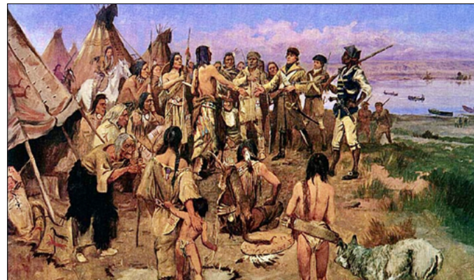
Photo: Captain William Clark of the Lewis and Clark Expedition Meeting with the Indians of the Northwest by Charles M. Russell, 1897.