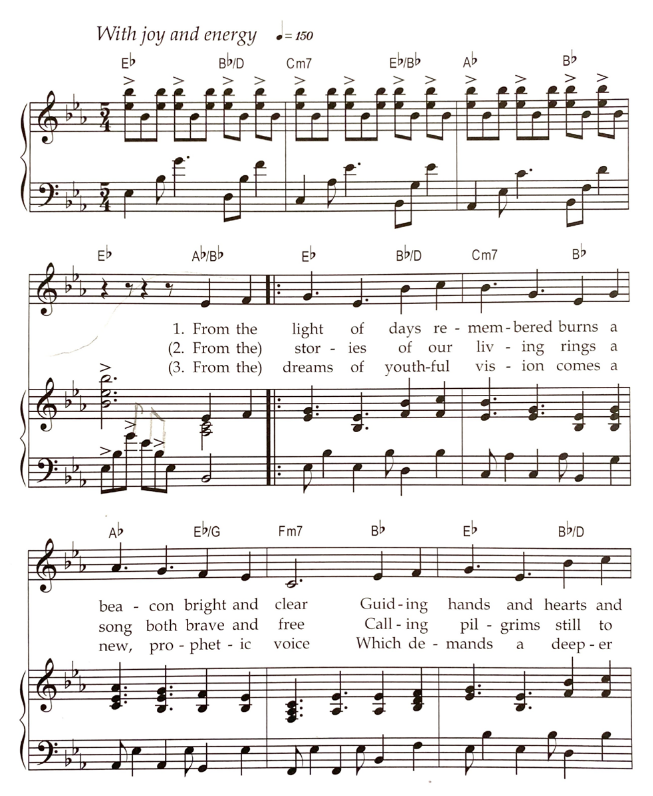
Note: The use of percussion is highly recommended.