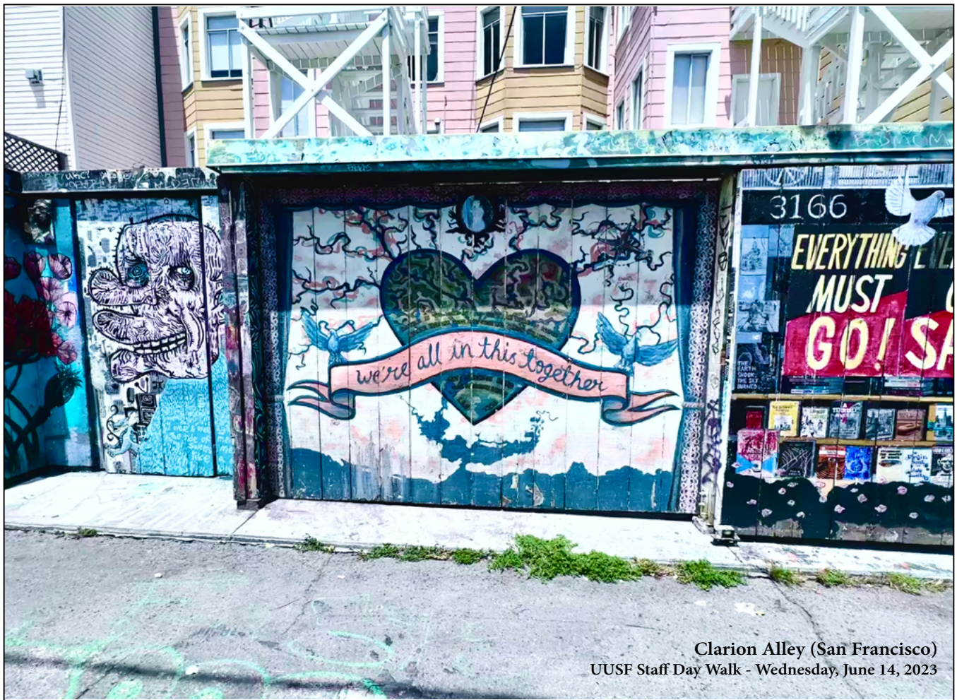
Clarion Alley (San Francisco) UUSF Staff Day Walk - Wednesday, June 14, 2023