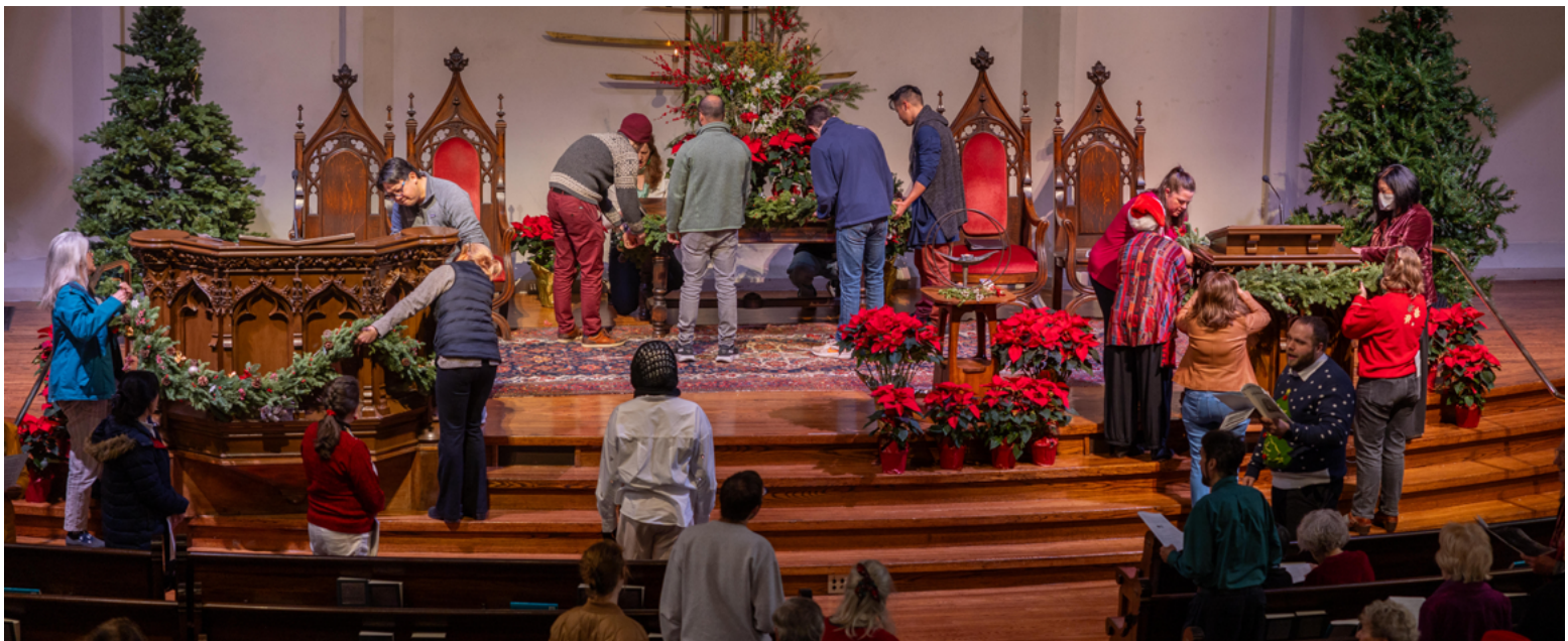
Members hang the greens that were decorated during the service on the chancel on Sunday, December 17, 2023.

Go to our website at https://www.uusf.org/