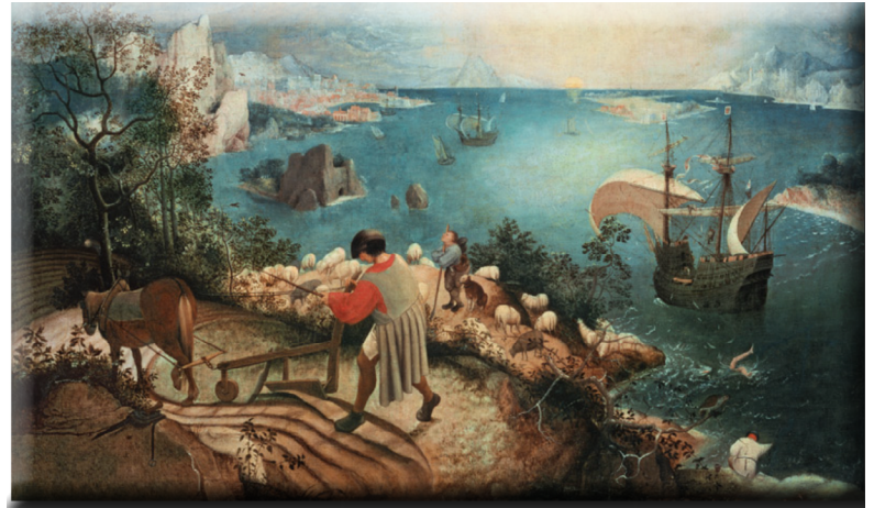
Photo: Landscape with the Fall of Icarus by Pieter Bruegel the Elder c.1560