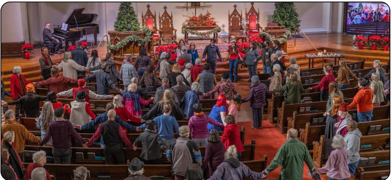
From the December 15, 2024, Hanging of Greens Service