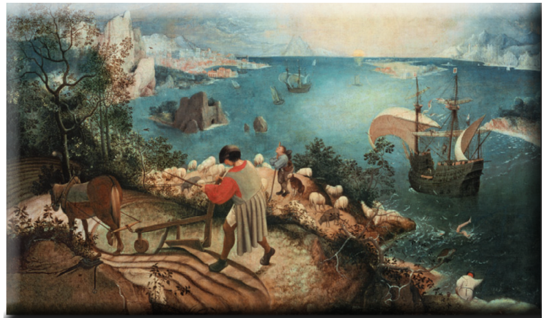
Photo: Landscape with the Fall of Icarus by Pieter Bruegel the Elder c.1560