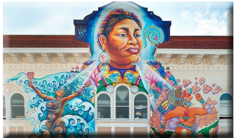
Photo: The Women's Building San Francisco. Learn more at https://www.uusf.org/soulmatters

In February, month of indecision, A strained inclusion permeates the air— Squabbling sparrows shower with derision Spring's timid green, apparent everywhere; In colder climates, there might still be snow, Yet ripeness is implicit in the light That sifts through foliage to lawns below, Turning the withered grasses golden white. This skittish moment when two seasons meet Seems to encompass all the lumbering year: Spring's frigid drizzle and late autumn heat, Petulant fogs that never really clear. May we, too long indoors, resolve to be Open to nature's inclusivity.